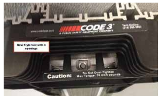
Post 2011 Mounting System