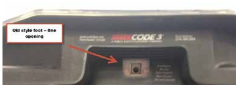
Pre 2011 Mounting System