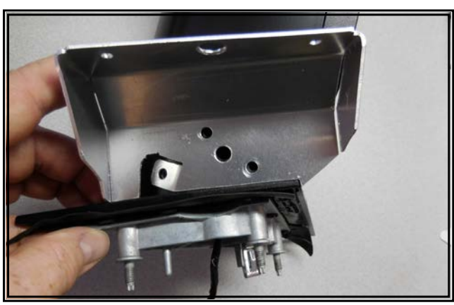
<----- TO FRONT OF VEHICLE Figure-1</p>

Step-4. Pull the vehicles side mirror wiring grommet out of the hole in the mirror assemblys die cast mounting bracket. Twist the light head cable wires together as shown in Figure 4, feed the light head wires/cable through the 9/32" hole in the vehicle's mirror housing drilled in step 2, and pull the wires through the hole in the die cast mounting bracket as shown in Figure 5 on page 3.