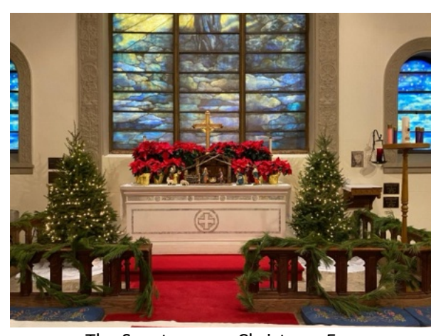
The Sanctuary on Christmas Eve