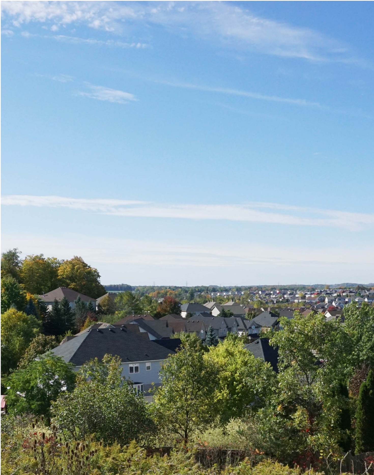
Overlooking the Doon Neighbourhood