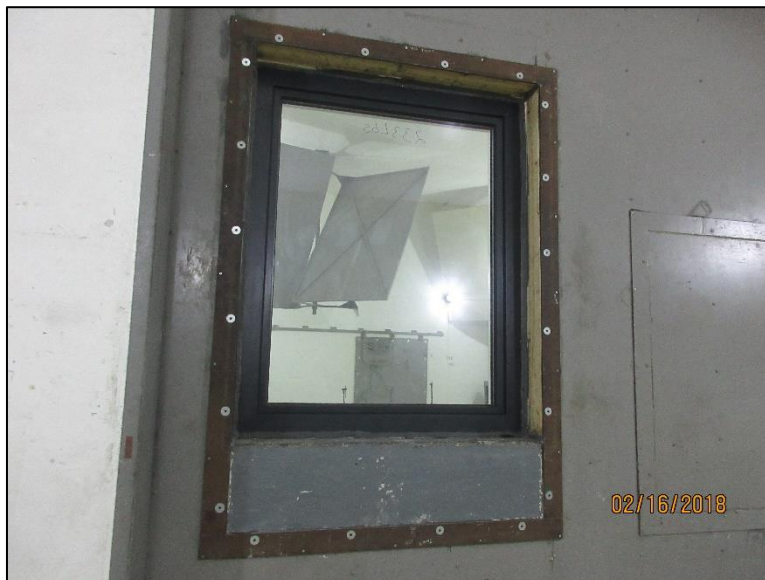
Photo No. 2 Source Room View of Installed Specimen