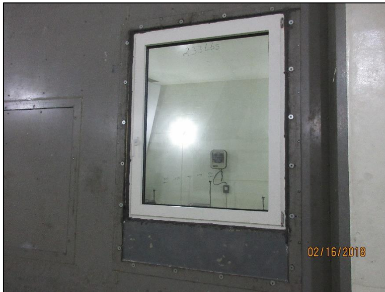
Photo No. 1 Receive Room View of Installed Specimen