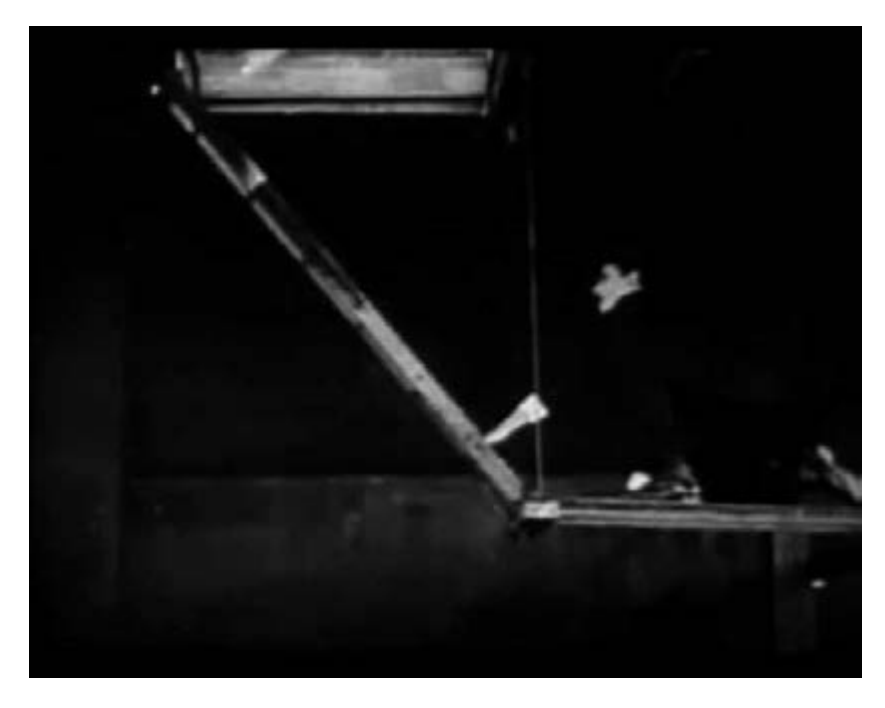
2. Film still from A Woman in Grey (Serico, 1920). Underneath the trap door, a halfway-extended, intermediate story becomes visible, with a ladder that connects to the trap door (episode 9, 'Burning Strands').

Such sequences indicate an understanding of films as enabling only a partial view. The frame captures a portion of the contingent, assembling what can be considered anecdotal evidence of an inferable larger space. By visualizing some of the elements that were previously neglected, the following episode acknowledges film's need to exclude elements from screen. The acknowledged partial indexing of the contingent—that is, the understanding that film compiles anecdotes—is what most readily differentiates the vernacular modernism of film serials from other filmic forms. In short, film serials employed an anecdotal approach to filmic