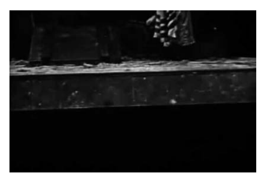
1. Film still from A Woman in Grey (Serico, 1920). Ruth Hope stands near a trap door; the camera descends (episode 8, 'The Drop to Death').

silent era and was consolidated in sound serials. It allows a narrative opening of the 'meanwhile' off screen, by means of which each episode stresses that its precursor only provided a fragment of the story—one snippet of the vast accumulation of contingent options.