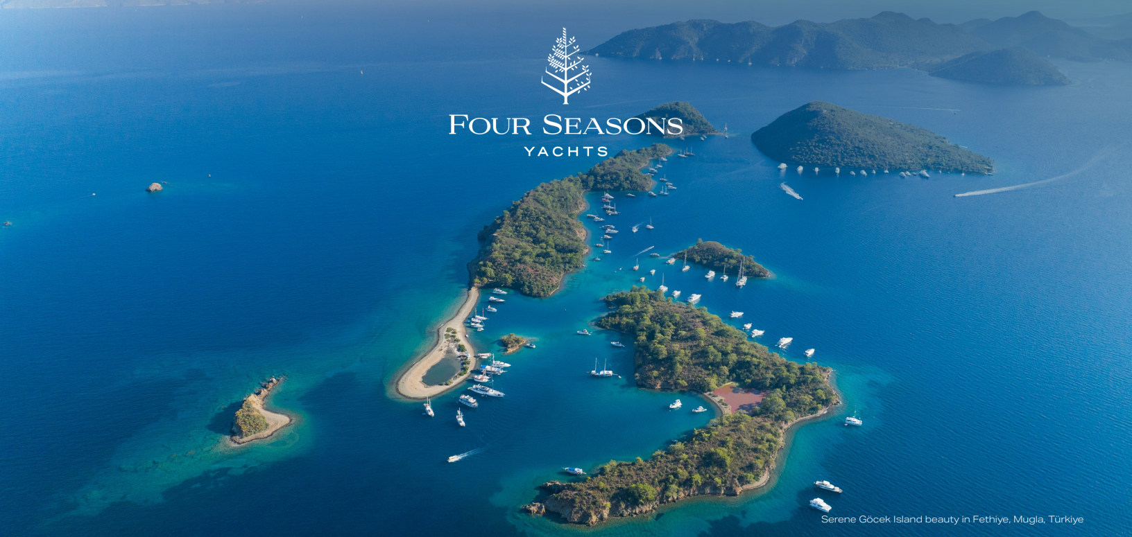
Serene Göcek Island beauty in Fethiye, Mugla, Türkiye