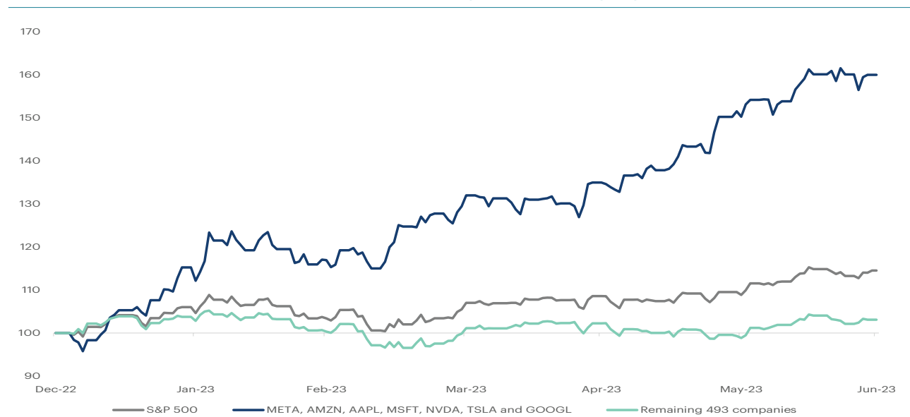
Chart 1: Performance of US S&P 500 Index including and excluding Big-Tech

Last year's outperforming sectors – energy (due to surging oil prices) and utilities (due to their defensive characteristics) – are lagging in 2023. Both these sectors are down -7% year-to-date. In contrast, last year's laggard, information technology, has rallied strongly with the S&P 500 IT Index gaining +42% so far this year. As the chart below shows, almost all gains in the US share market this year have been driven by just a handful of technology companies.