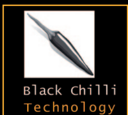
Black Chilli Technology

The macro-block design of the tyre's outside shoulder provides a larger contact area, which can therefore adapt optimally to the road surface. The ContiSportContact™ 5 offers improved road grip and thus more safety when cornering.