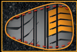
macro-block technology - Standard footprint - Footprint with macro-block technology