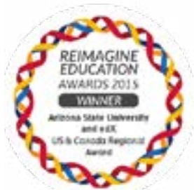
Reimagine Education Awards - 2015 US & Canada Regional Award Winner