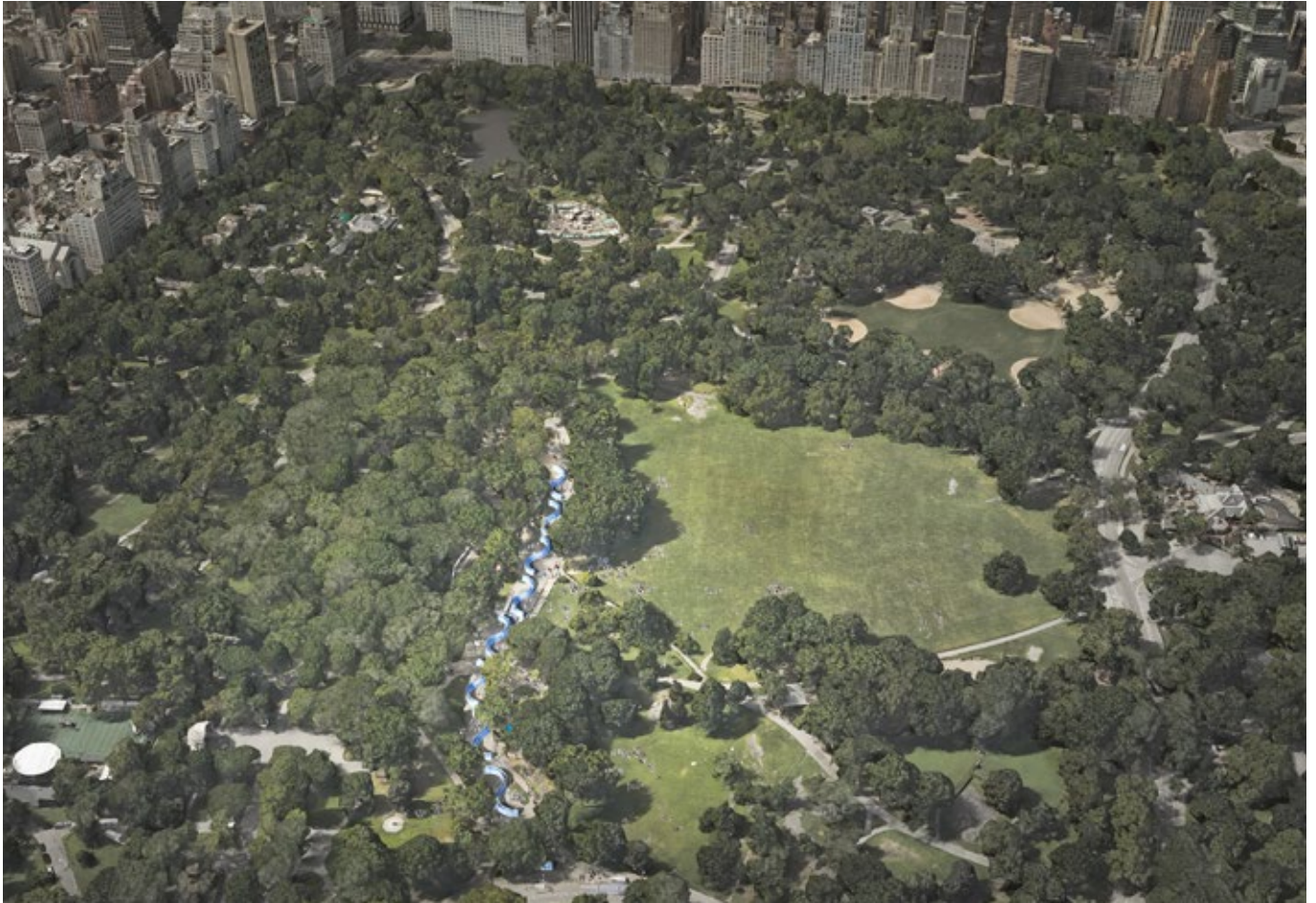
Breathe With Me in Central Park, New York City, September 2019