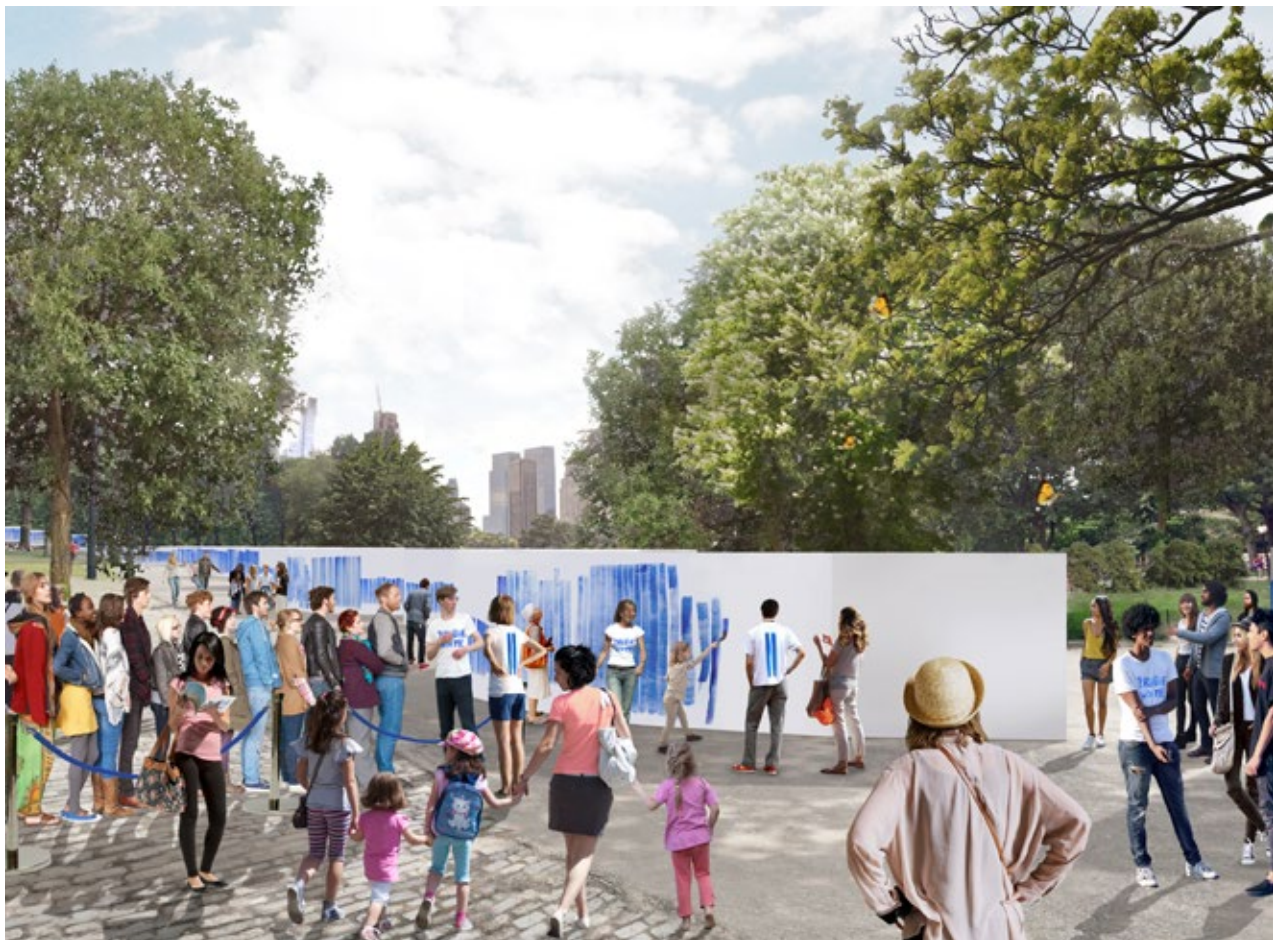
Breathe With Me in Central Park, New York City, September 2019