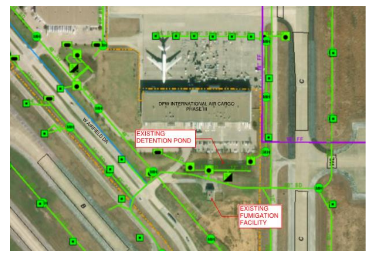
Figure 2 Proposed West ARFF Station Location

drainage from the DFW accept International Air Cargo ramp and the new West ARFF Station development. In addition, first flush drainage from Line I3 of the First Flush System (purple line in Figure 2), which collects the first flush from approximately 126 acres of impervious area from the UPS, American Airline Hangar and International Air Cargo ramps, will be diverted into this new detention pond. The final design must comply with the first flush requirement of capturing 0.25 inches of runoff from impervious areas by incorporating a pilot channel in the proposed pond with