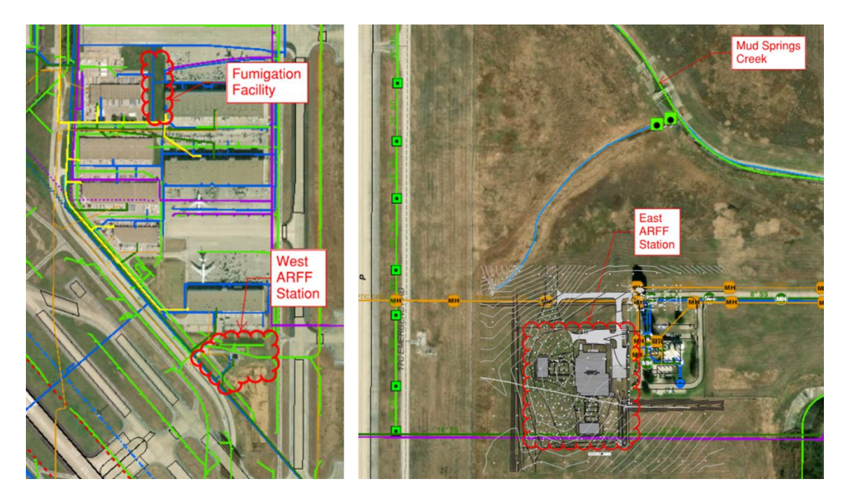
Figure 1 Project Locations

The project includes the following three (3) separate sites: West ARFF Station, East ARFF Station and a Fumigation Facility. The proposed West ARFF Station 7-acre development area is located of west of Taxiway C and south of the DFW International Air Cargo III facility. The proposed Fumigation Facility 2-acre development area is located on West 23<sup>rd</sup> St. The proposed East ARFF Station 5-acre development area is located east of Taxiway P adjacent to the FAA East Control Tower (refer to Figure 1 and Exhibit I, II and III - Proposed Drainage Maps for the three (3) development).