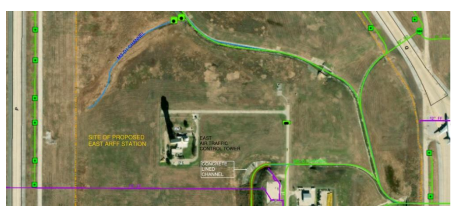
Figure 3 Proposed East ARFF Station Location

The East ARFF Station will need to be split into three (3) sub drainage areas with the north drainage area draining into Mud Springs Creek via the existing MS-D1 channel to the north of the development and south drainage areas 1) draining to the existing MS-C concretelined channel to the east of