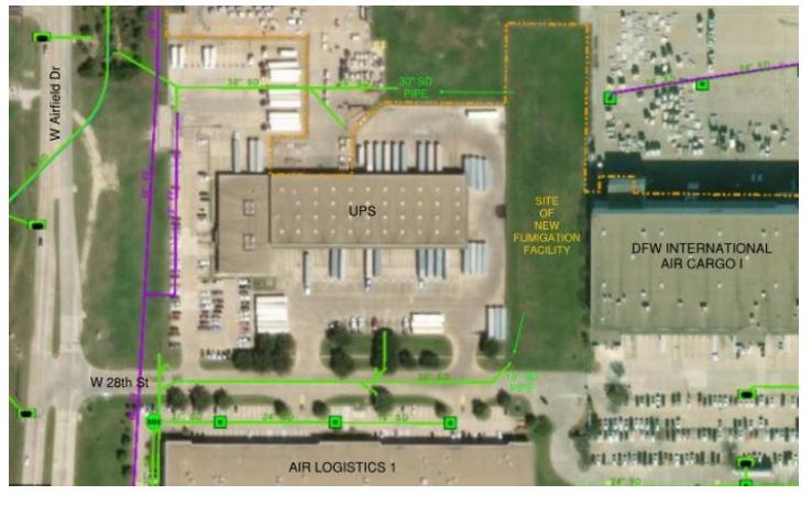
Figure 4 New Fumigation Facility Location

comply with the first flush requirement of capturing 0.25 inches of runoff from impervious areas by incorporating a pilot channel in the proposed pond with layered media that can filtrate the runoff (excluding roofs). Per Section 3 – Preliminary Data and Design Requirements of the referenced Report, the concept is to incorporate stormwater detention with filtration media.