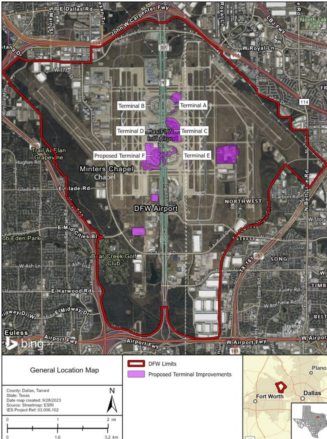
Figure 3.1. DFW General Location