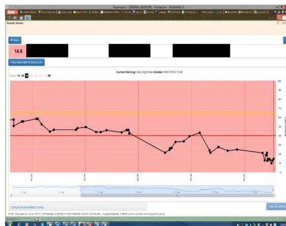
Figure 1a A Rothman Index (RI) graph for a single patient. RI is on the y-axis, scale 0-100. For calibration: 100 is unimpaired, 65 is the acuity level typical for a patient discharged to a SNF, 40 is the acuity level when a physician might consider moving the patient to an ICU. Each dot reflects the score and the time when a new piece of data has been entered into the EMR and the RI was recalculated. Graphs are color-coded by the most recent score; below 40 the background of the graph is red, 40-65 it is yellow, and above 65 it is blue. Vertical lines are at midnights. This patient graph shows a 5-day history. RI has just fallen below 20, which triggered a “Very High Risk” alert.