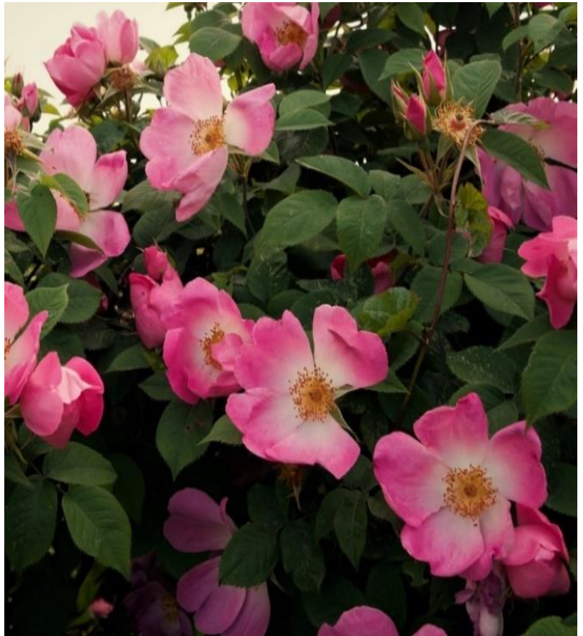
Complicata Rose