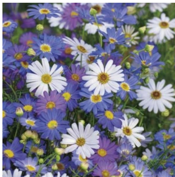
Swan River daisies

A simple, but stunning container for the shadier area might include, amber coloured coleus with delicate apricot fancy-leaf begonias, in both upright and trailing varieties. Or turn this into a larger display and combine those with white upright begonias, white trailing geraniums, white trailing Euphorbia and mauve Swan River daisies to make a real statement.