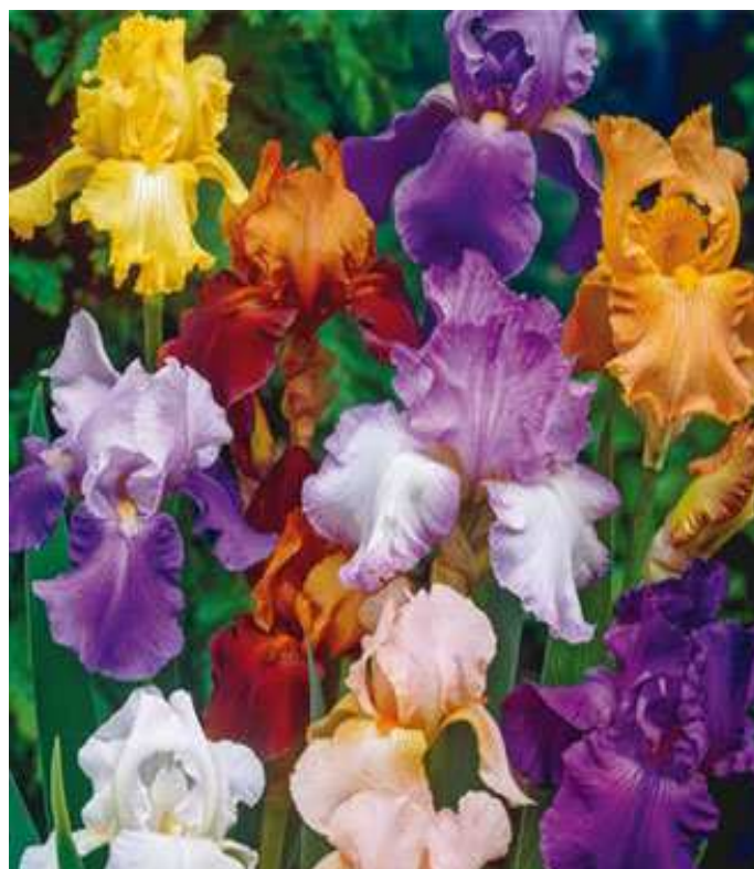
Tall Bearded Irises...