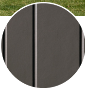
Hardie™ Oblique™ Cladding