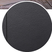
Hardie™ Fine Texture Cladding

Note: This card is designed to fit an A3 page if printed. Please consider the environment before printing.