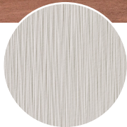
Hardie™ Brushed Concrete Cladding