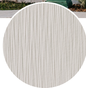
Hardie™ Brushed Concrete Cladding

Note: This card is designed to fit an A3 page if printed. Please consider the environment before printing.