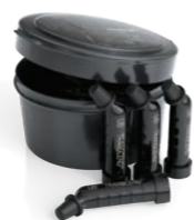
4757 - Transcend UB Singles 1pk 10 x 0.2 g singles Universal Body shade