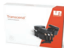
4814 - Transcend Singles Intro Kit 10 x 0.2 g singles of each shade: A1D, A2D, A3D, B1D, EN, EW, UB

Pair Composite Wetting Resin with any Ultradent composite to improve instrument and composite glide when sculpting and contouring.