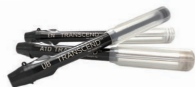
Transcend Syringe 1pk 4 g syringe