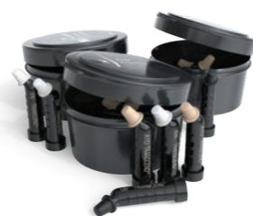
Transcend Singles 1pk 10 x 0.2 g singles