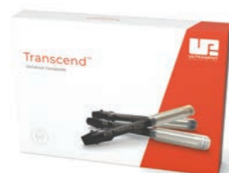
4726 - Transcend Syringe Intro Kit 1 x 4 g syringe of each shade: A1D, A2D, A3D, B1D, EN, EW, UB