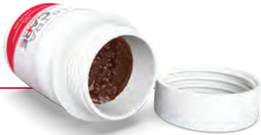
301 - Ultracare Waterberry Topical Bottle 1 x 1 oz bottle