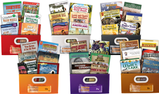
Thematic Levelled Text Set

Informational text sets deliver grade-level content through independent reading and differentiated instruction. Students read from a leveled library of books on the same topic as they build background knowledge and academic vocabulary in Science and Social Studies content.