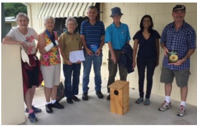
MOTT attended the Voluntary Conservation Programs End of Year Workshop organised by Morton Bay regional council. We cleaned up with a couple of door prizes, two beautiful books and a nest box. Thanks MBRC for a great morning