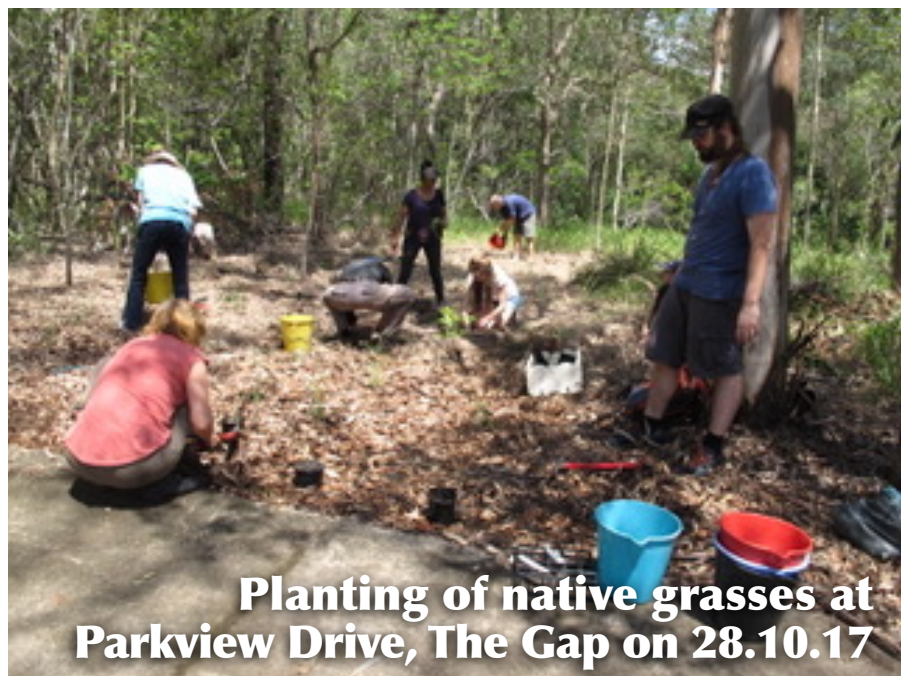
Planting of native grasses at Parkview Drive, The Gap on 28.10.17