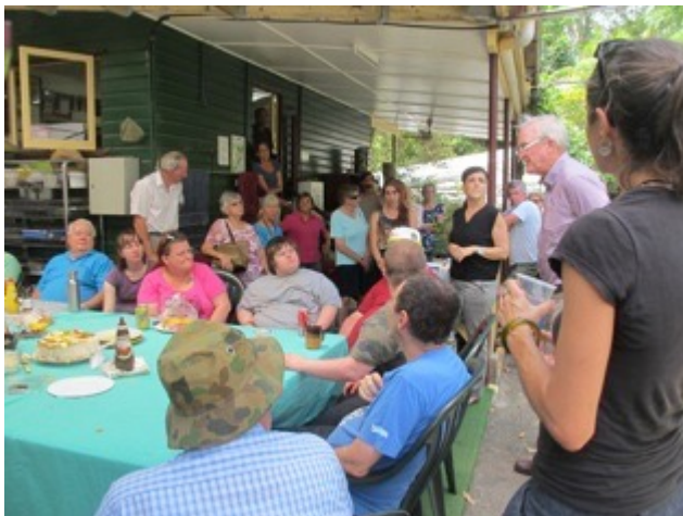
Volunteers who have been working at the nursery say "Goodbye" on Friday 21 st .

Greening Australia has changed course and is now focusing on large-scale landscape restoration Australia-wide and as a consequence of this it concluded its operation of the Paten Park nursery on November 21 st and will be handing it back to the Brisbane City Council on November 28 th .