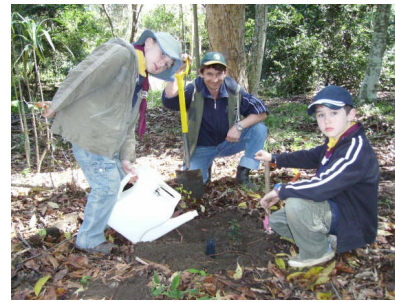
Scout planting patrol in action

One hundred and twenty-three (123) men, women and children, Chinese, Indian, Australian and Canadian showed us that they wanted to MAKE A DIFFERENCE. MOTT's planting team had organized one site for the planting until the response from church groups, cubs, scouts and community was so overwhelming that we had to ask Habitat Brisbane for a second site so that we could plant 1600 trees instead of the original 750.