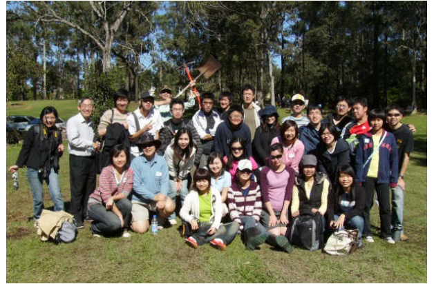
The Sherwood Methodist Church group in force