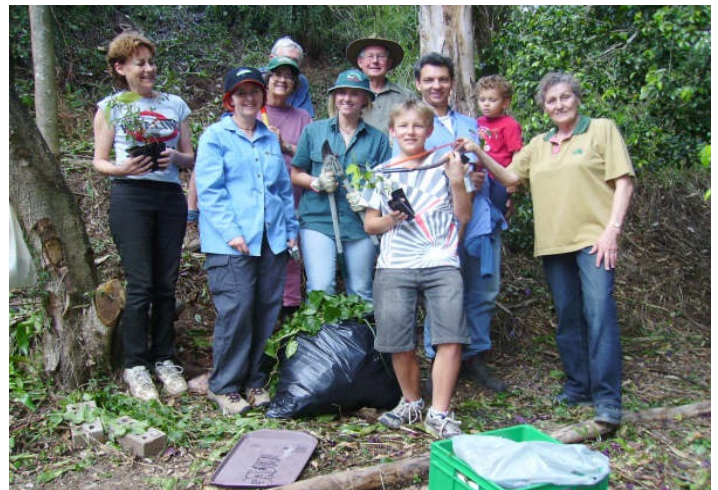
Some of the Busters

Thanks to all sixteen volunteers, who produced a weed heap of no mean proportions, and frustrated with appropriate ammunition the feline captivation (Cat's Claw Creeper) of umpteen trees.