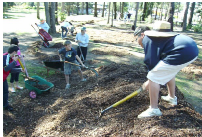
Making a start on the mountain of mulch

One hundred and twenty-three (123) men, women and children, Chinese, Indian, Australian and Canadian showed us that they wanted to MAKE A DIFFERENCE. MOTT's planting team had organized one site for the planting until the response from church groups, cubs, scouts and community was so overwhelming that we had to ask Habitat Brisbane for a second site so that we could plant 1600 trees instead of the original 750.