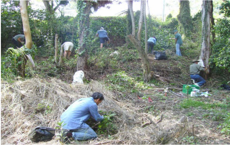
Making a dint in the wall of weeds

It was no coincidence to find the Saturday MOTTs weeding Ithaca Creek at the beginning of Weedbuster Week. Of course, removing weeds to 'grow me instead' is what our group is usually about. However, the day was made special by the special people who helped us with our work.