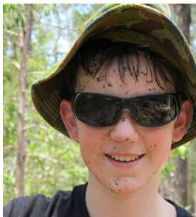
A baptism of mud!