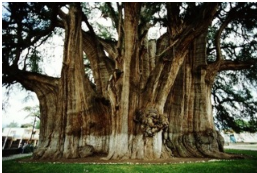
The Tule Tree, listed as one of the ten greatest trees in the world.