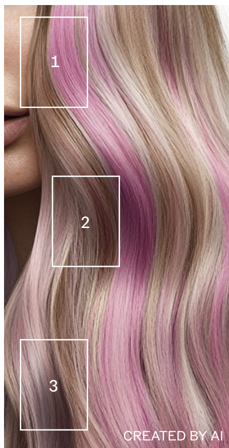
CREATED BY AI