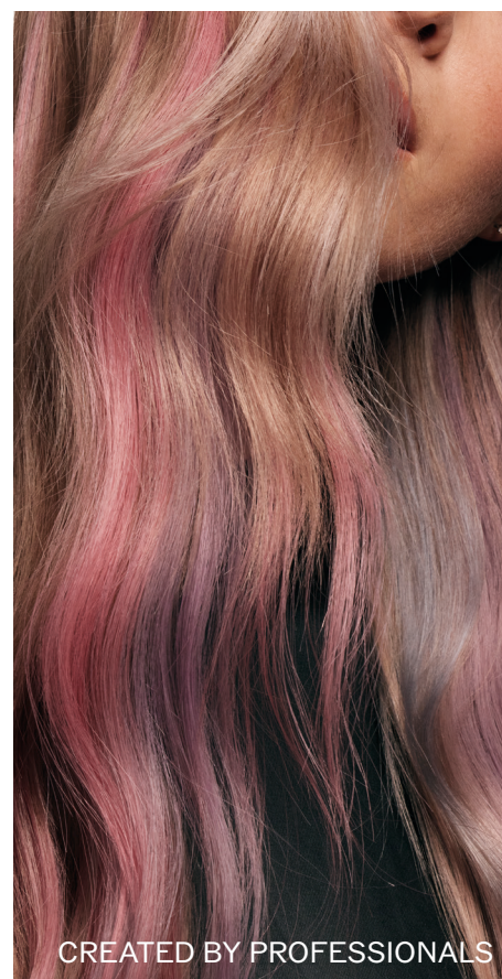
CREATED BY PROFESSIONALS