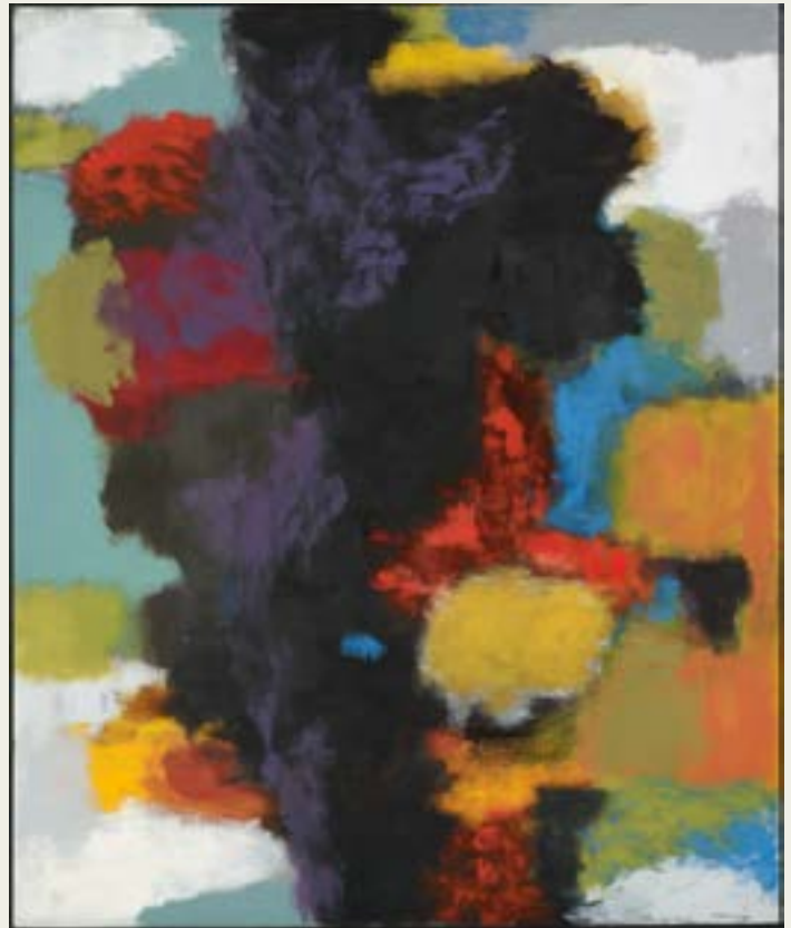
Felrath Hines (American, 1913–1993), Untitled , 1960, oil on linen, 72 × 60 in. Indianapolis Museum of Art at Newfields, Robert and Ina Mohlman Art Fund, 1994.116 © Felrath Hines.