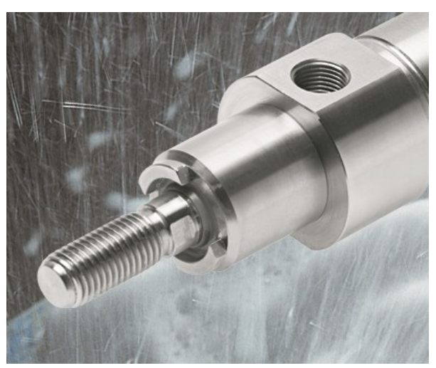
Reliable function – the dry-running seal from Festo (e.g. CRDSNU drive)

Dry-running seals ensure the reliable function of the components (e.g. of the drive), even if the lubricant is washed out through intensive cleaning.