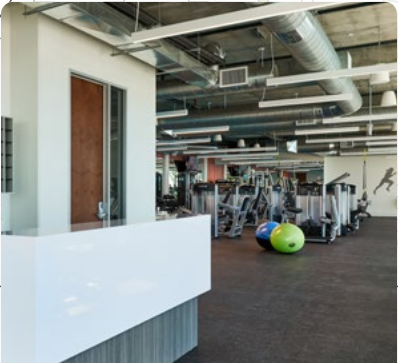
Fitness Center / Yoga Studio