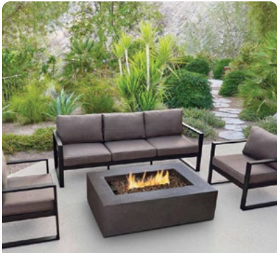
Collaboration Area with Fire Pit