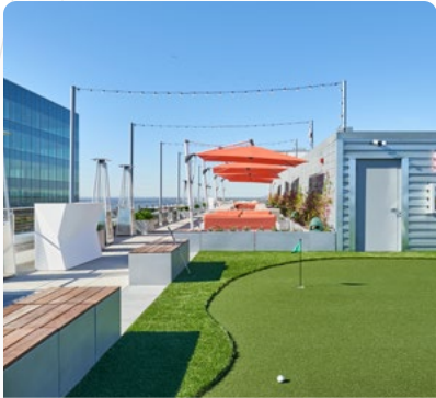
Rooftop Lounge & Putting Green