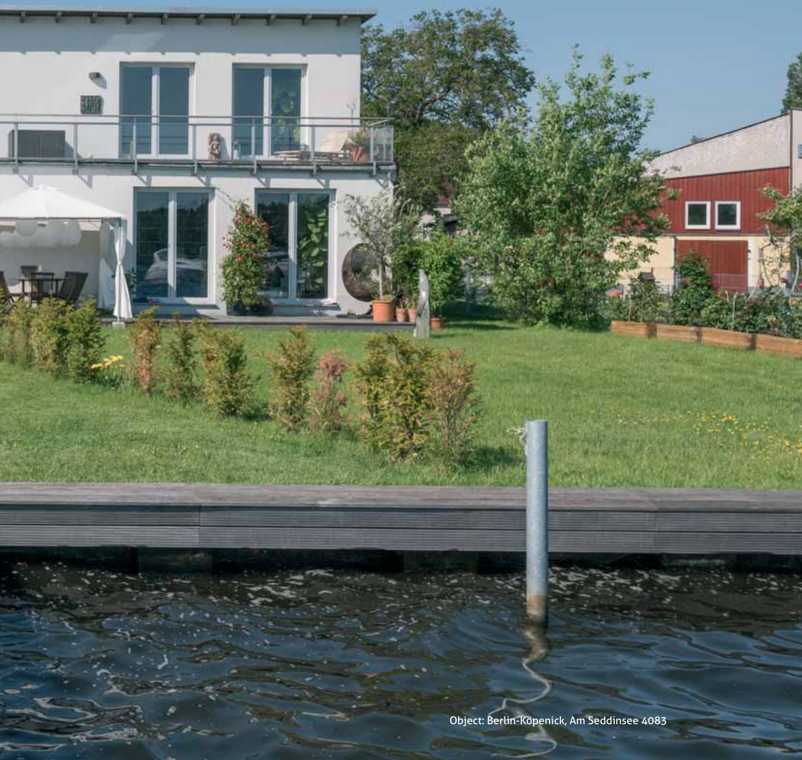
Object: Berlin-Köpenick, Am Seddinsee 4083