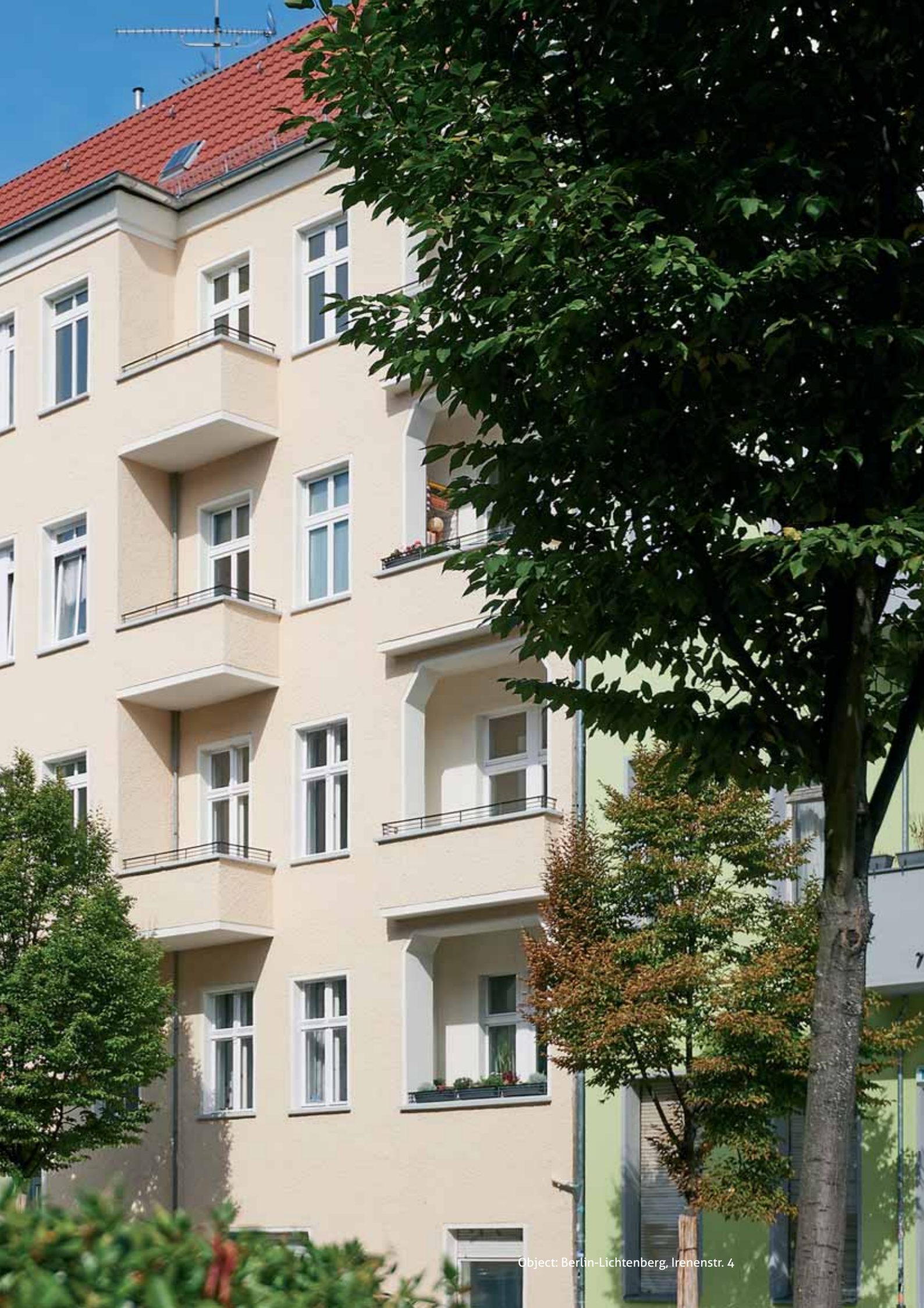
Object: Berlin-Lichtenberg, Irenenstr. 4