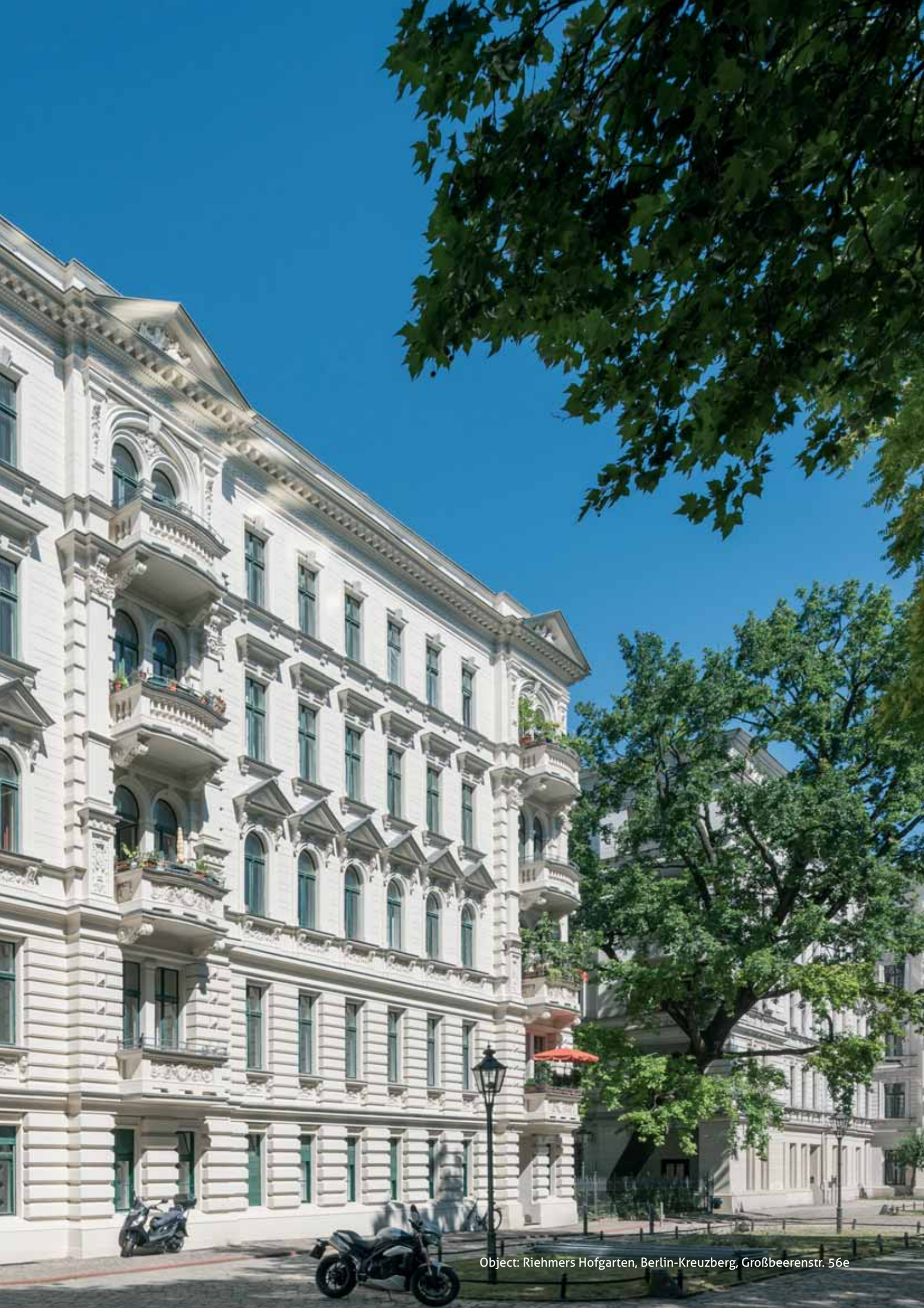
Object: Riehmers Hofgarten, Berlin-Kreuzberg, Großbeerenstr. 56e