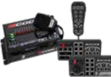
Z3S™ SIREN - MATRIX® 20 EASY TO OPERATE CONTROL HEAD 200W / 300W Matrix software