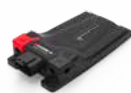
SWITCH NODE - MATRIX® ADDITIONAL OUTPUT CONTROL Waterproof 16 Additional ouputs