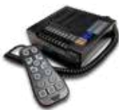
H2COVERT™ SIREN 20 HAND-HELD CONTROLLER 100W / 200W Push button programmable siren tones