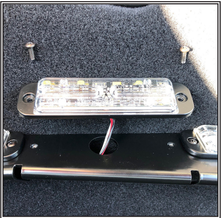
Figure 2 Figure 3