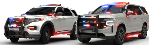
V2V Flash Pattern Synchronization