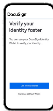
If an Identity Wallet is created, the signer can accelerate the required identity verification process