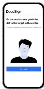
The signer self-serves the ID verification process on their mobile