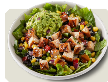
Salad cal 110-500 Picante Ranch or Citrus Lime Vinaigrette