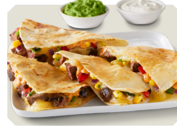
Grilled Quesadilla cal 970 Ask about Cheese-Crusted