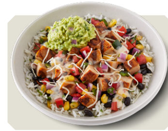
Bowl cal 310-330