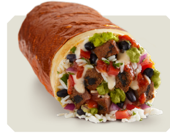
Burrito cal 610-640