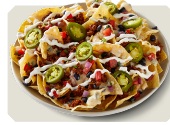
3-Cheese Nachos cal 730-740