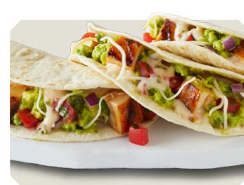
3 Tacos cal 180-210 Flour or Crispy Corn Tortillas