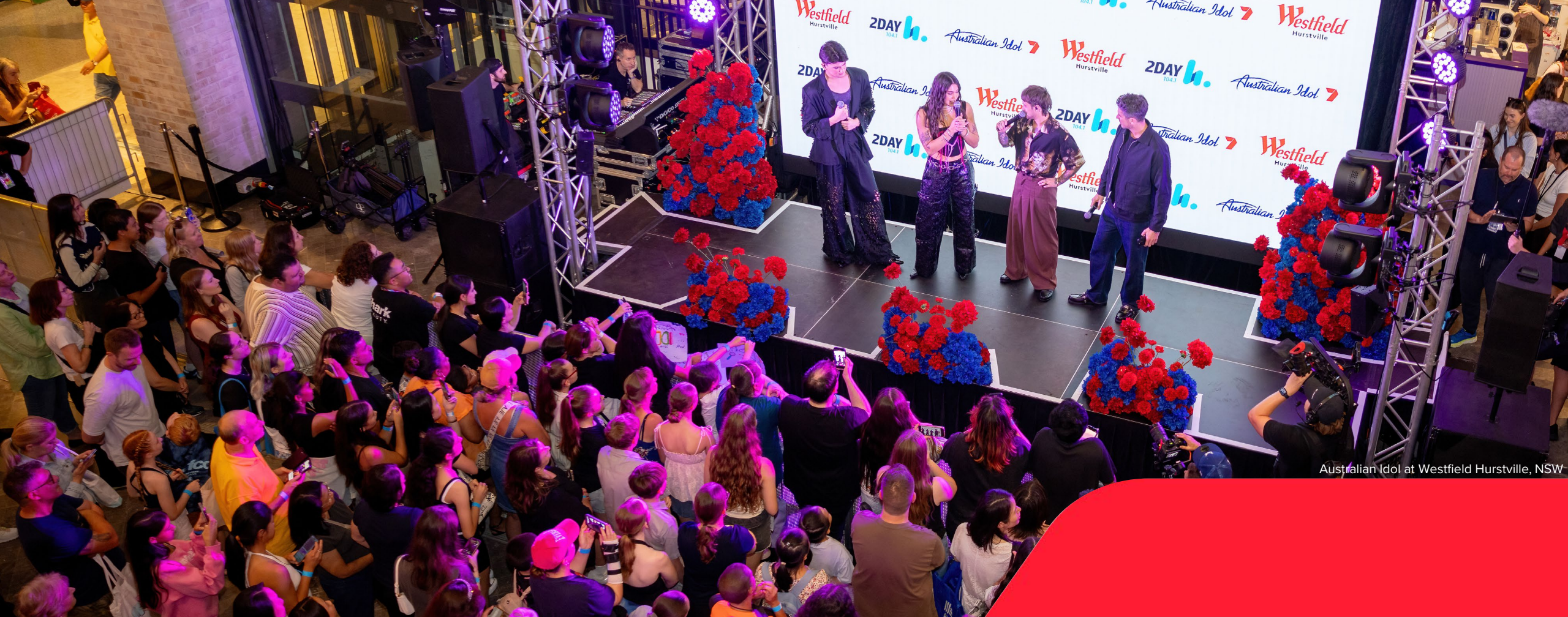
Australian Idol at Westfield Hurstville, NSW