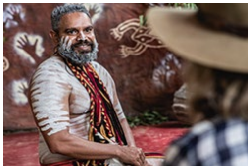
Pamagirri Aboriginal Experience at Rainforestation Nature Park - groups

Gain an deeper understanding of Jawoyn culture on a hands-on cultural experience. Spend the day with the Jawoyn people, sharing their culture, learning their ways and trying some of the skills developed over thousands of years. Activities include basket weaving, spear throwing, fire lighting, painting, and learning the didgeridoo. A traditional meal of kangaroo tail and barbequed meat served with a selection of fresh salads will be served for lunch.