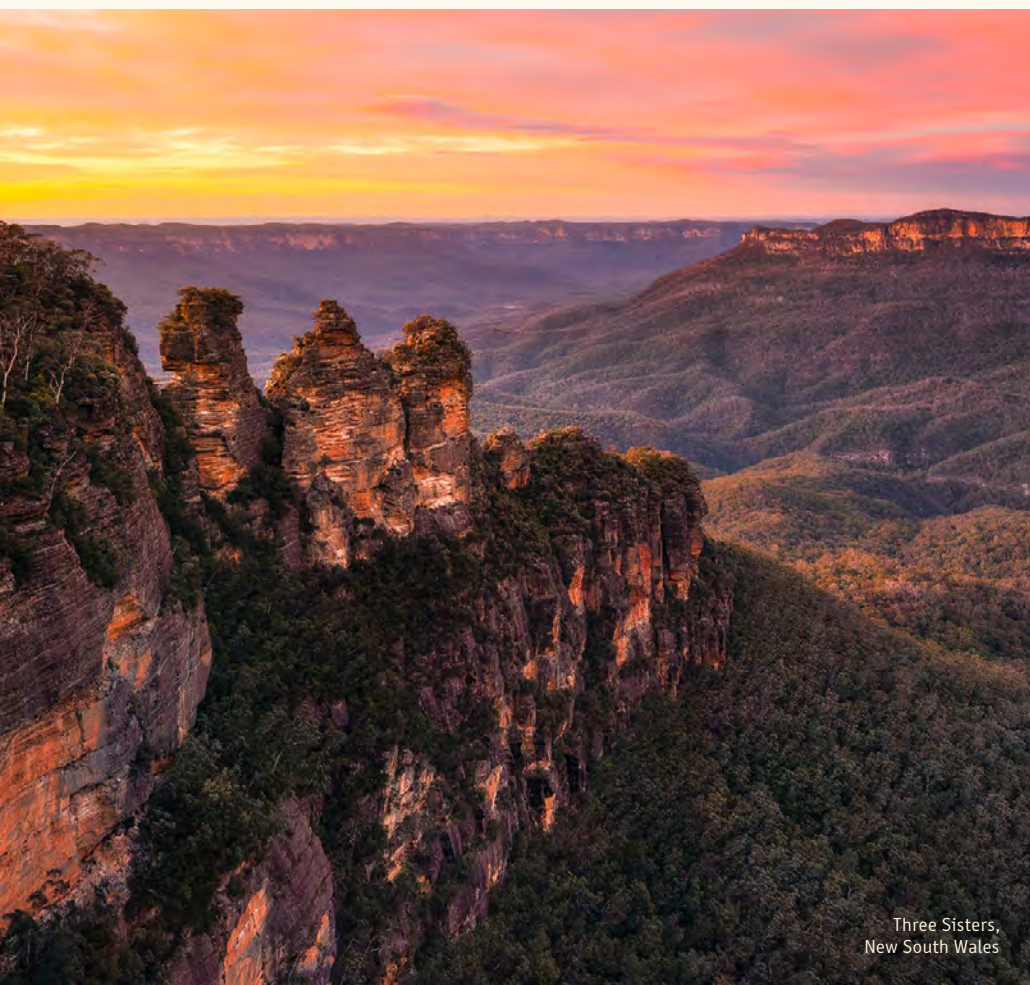
Three Sisters, New South Wales