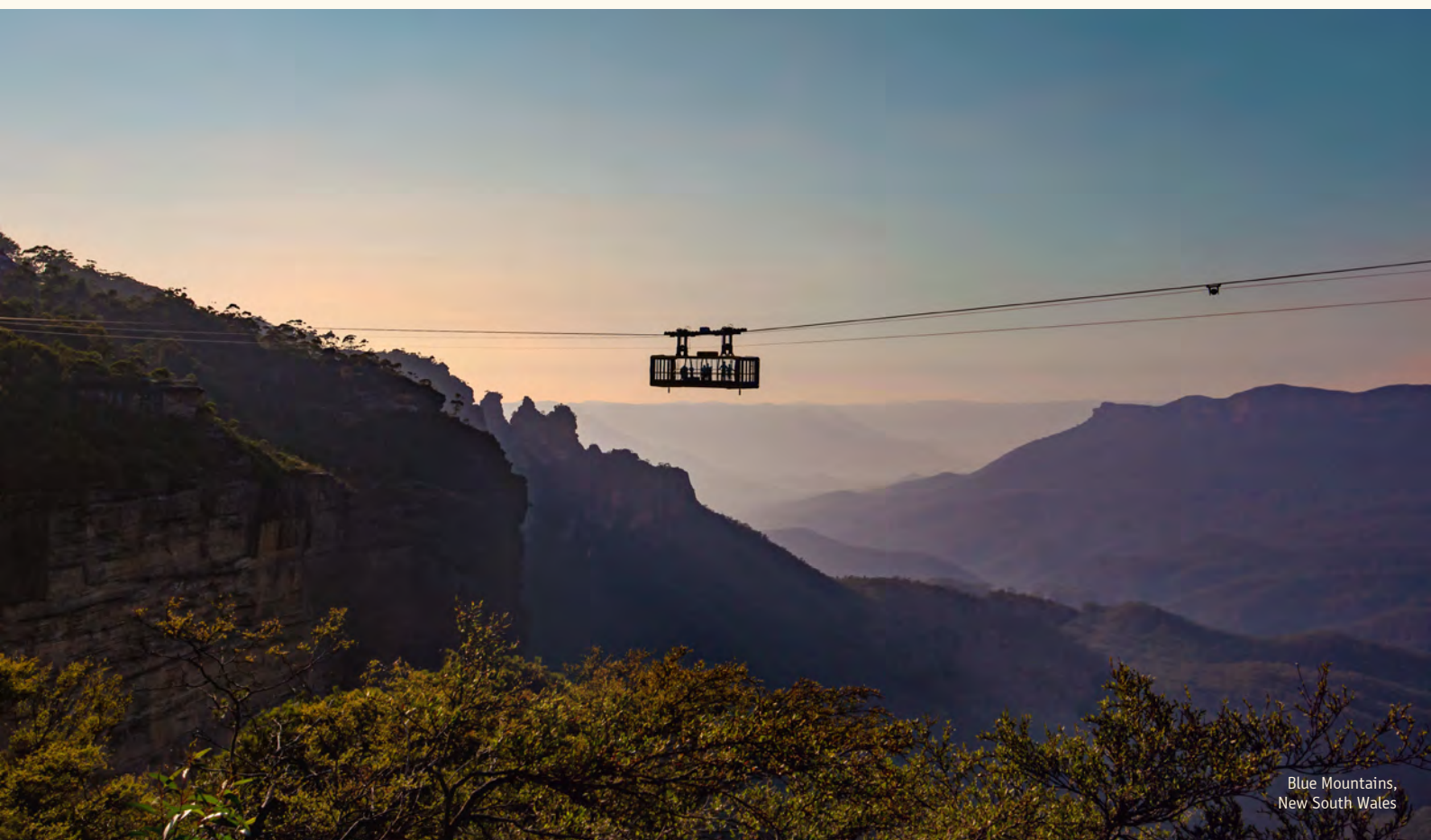
Blue Mountains, New South Wales