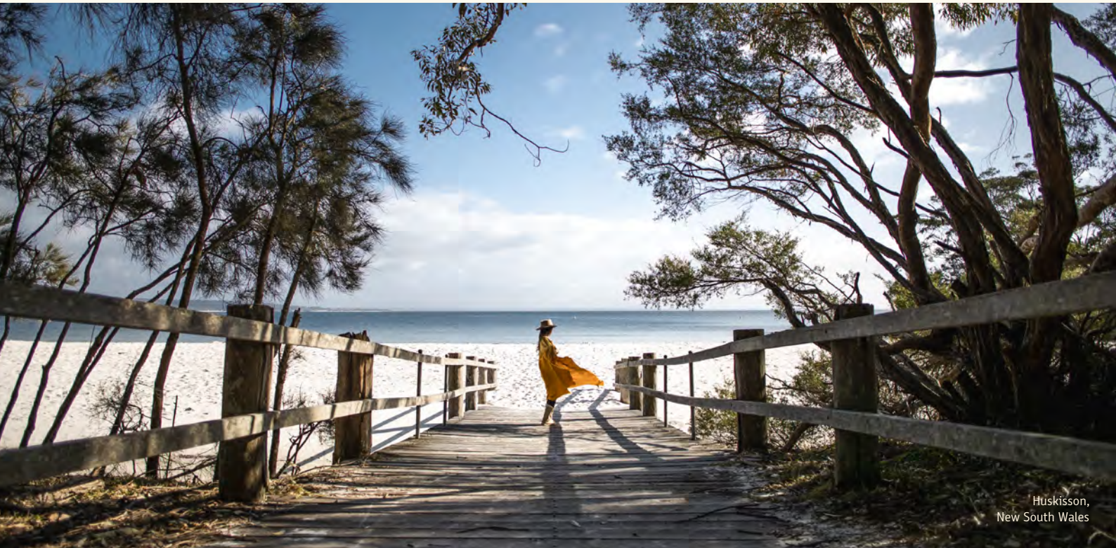
Huskisson, New South Wales