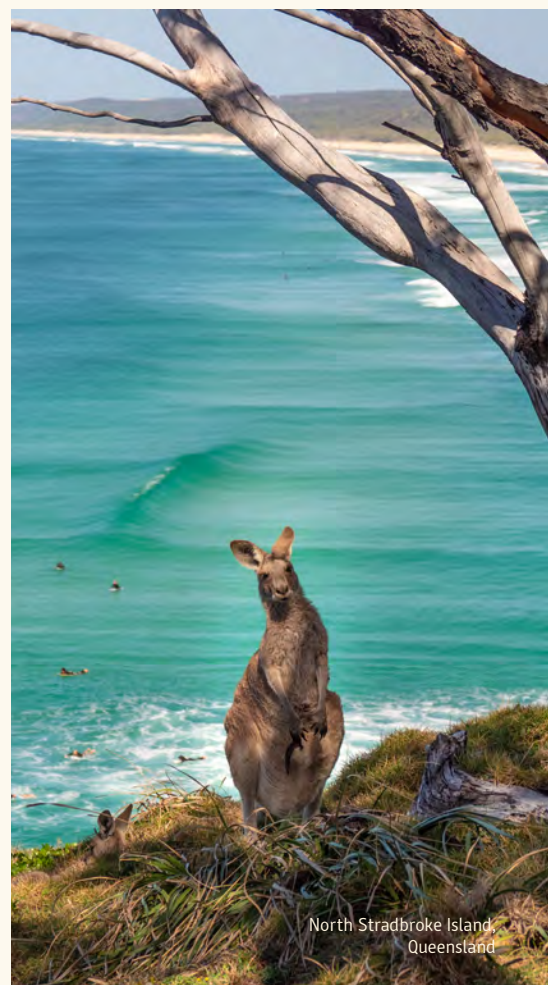
North Stradbroke Island, Queensland