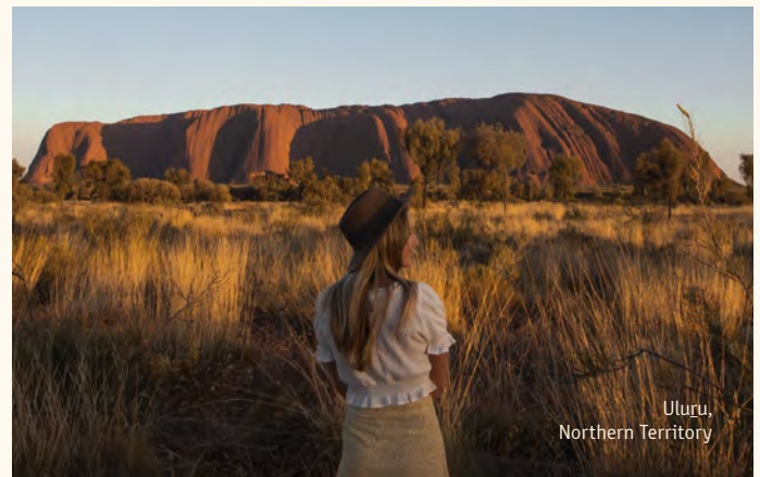
Uluru, Northern Territory

Another good tip is to connect the spokesperson to the journalist and panel members before the primary interview to ensure they are comfortable with each other and the talking points. Journalists are often under pressure when they are on a deadline. Do not feel pressured by a journalist and always remain calm and polite.