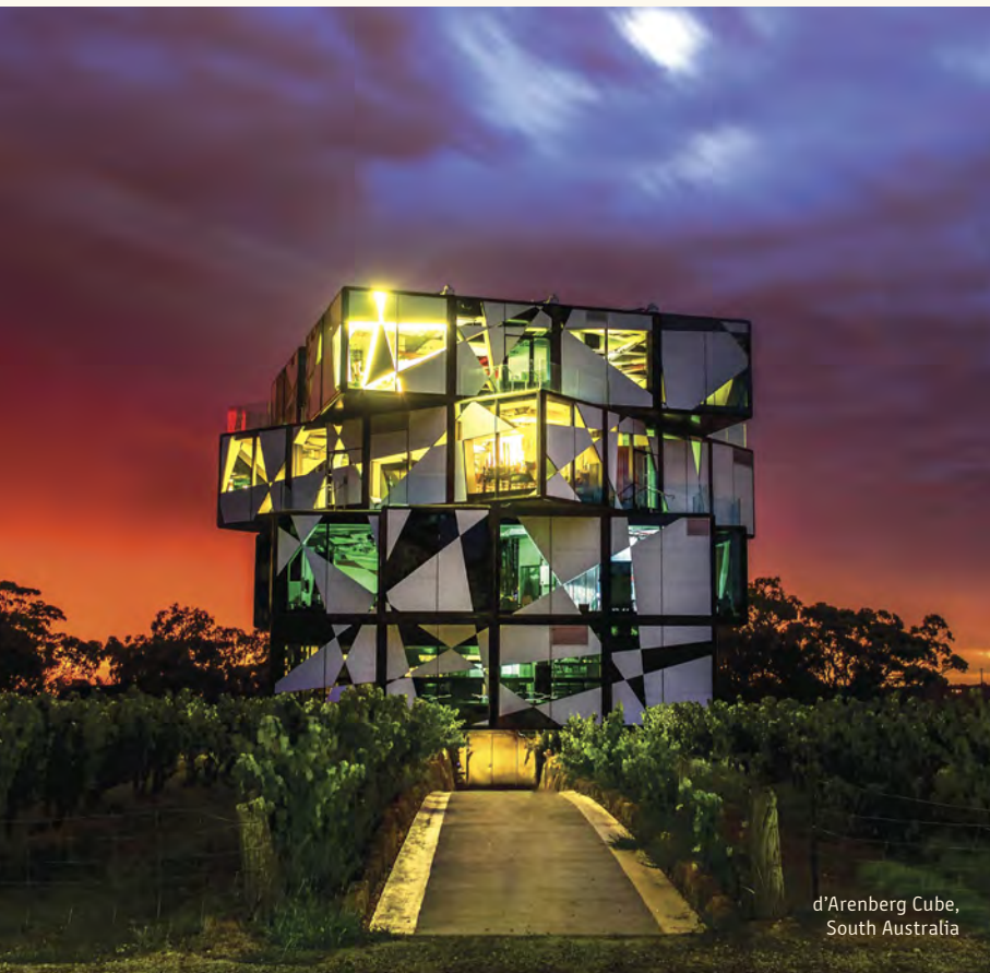
d'Arenberg Cube, South Australia