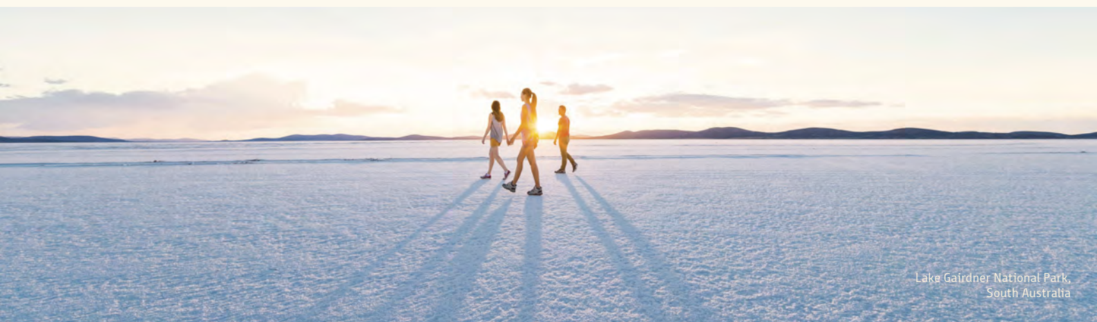
Lake Gairdner National Park, South Australia