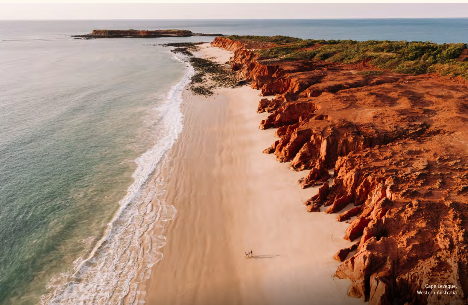
Cape Leveque, Western Australia