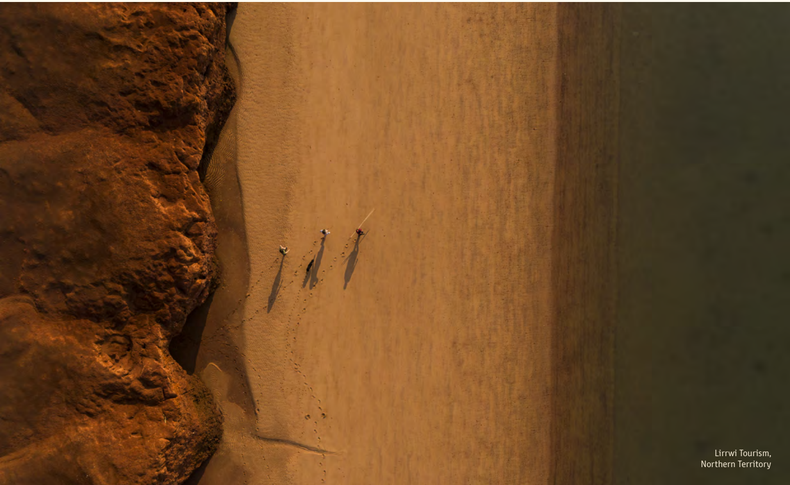
Lirrwi Tourism, Northern Territory