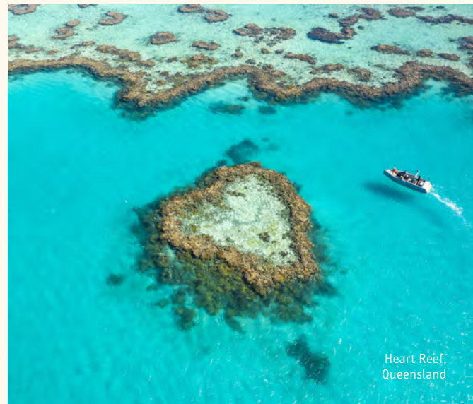
Heart Reef, Queensland