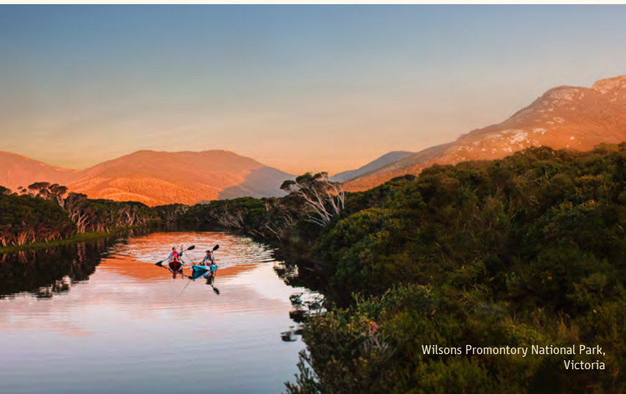
Wilson's Promontory National Park, Victoria