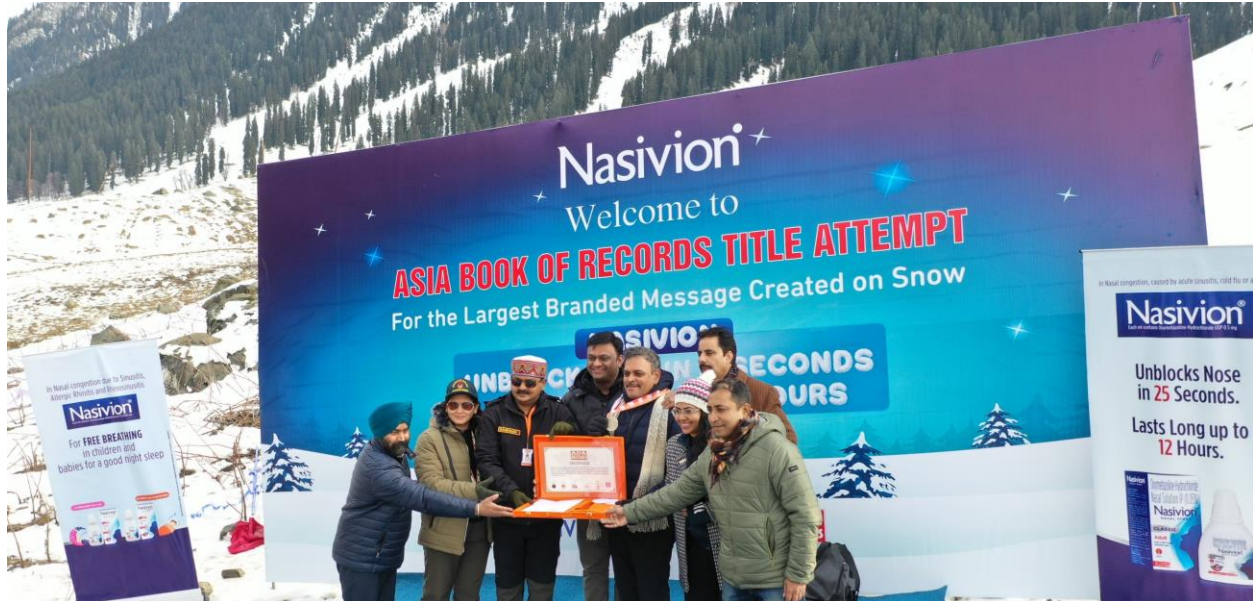
Seen here team Nasivion along with the team from Asia Book of Records celebrating the Largest Branded Message created on Snow in Sonmarg