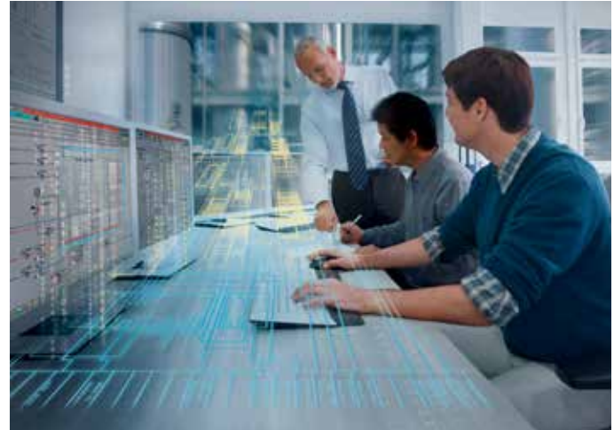
SIMATIC PCS 7 has everything you need to completely and safely automate your entire production process.