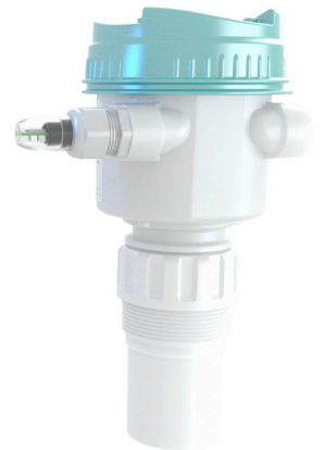
Easy access to Sitrans Probe LU240 via Bluetooth® adapter and Sitrans mobile IQ App