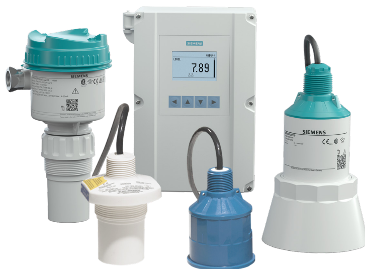
Sitrans LT500 compatible devices include radar and ultrasonic technologies or any 4-20 mA devices.

Siemens onboard Sitrans IQ Guard adds diagnostics and alerts to field instruments so operators can focus on the big picture. By working seamlessly with devices like Sitrans LT500, Sitrans LU240, and Sitrans LR500, this smart application suite enhances data collection and alerts operators to potential issues, streamlining operations and maximizing efficiency—ultimately saving companies time and money.