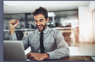
Xcelerator Academy Certification