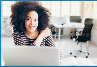
Xcelerator Academy Memberships