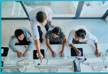
Xcelerator Academy Training