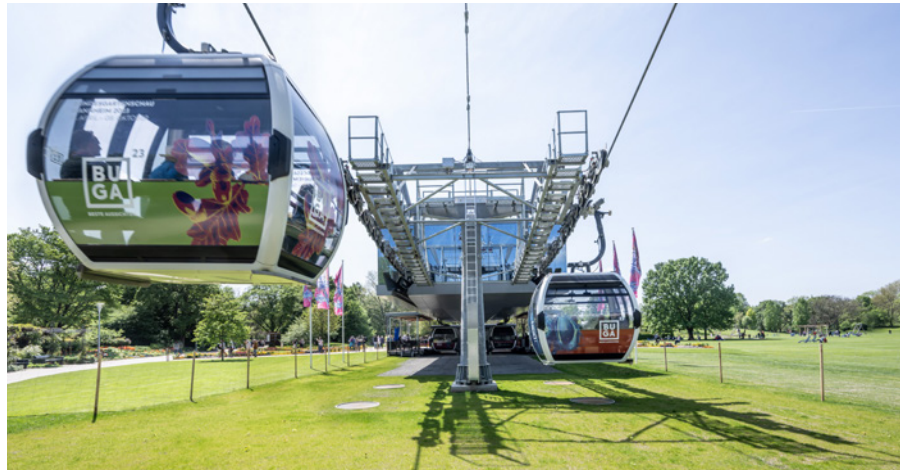
A monocabable cable car of two kilometers connects the two main parks of BUGA 23. The latest SCALANCE IWLAN technology from Siemens using the new Wi-Fi 6 standard ensures gap-free communication with the 64 cars.

Frey Austria GmbH in Innsbruck, Austria, which specializes in this type of application, has overseen and automated more than 700 aerial cable car systems across Europe. The core competencies of the Austrian firm include electrical equipping, modification, expansion, and retrofitting of cable car systems of almost every type. The portfolio comprises a broad range of electrical drive, automation, and visualization solutions as well as system engineering (hardware and software) for drag lifts, aerial cable cars, funiculars, gondola lifts, and chairlifts. The company has served in this profession for decades and has been a Siemens Solution Partner for aerial cable car applications since 2015. As a result, employees are highly skilled in handling SIMATIC automation technology, SINAMICS drives, and SCALANCE IWLAN technology as well as the associated Siemens software tools.