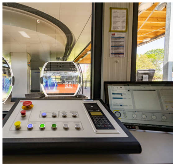
Guests receive information from the central control room when required via IWLAN and voice-over-IP messages.

During commissioning, the Austrian engineers dug deep into the Siemens bag of tricks, making use of the recipe management feature of the SIMATIC S7-1200 controllers for series commissioning. This allowed them to create the program once and then load it onto all the controllers. The configuration of IWLAN clients was also essentially performed only once and then transferred to the other devices using the CLP (Configuration and License PLUG) removable data storage medium.