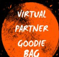
VIRTUAL PARTNER GOODIE BAG