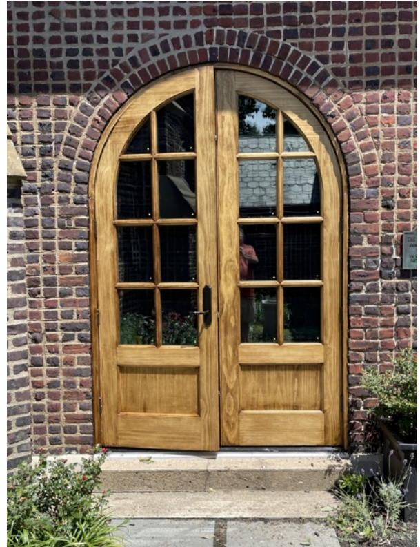
New cloister garden doors from the outside