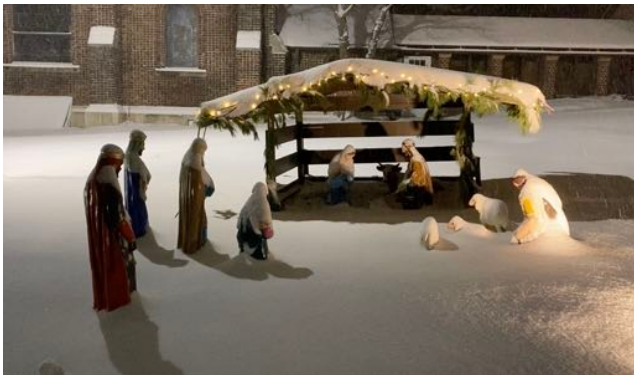
Outdoor Nativity scene