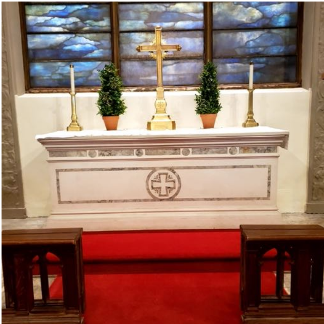
Dec 6- altar decorated with boxwood/holly "trees"