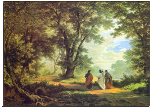
Road to Emmaus

On Sunday, June 12 at 4:00 pm , the North Shore Madrigal Singers will hold their spring concert at Trinity Episcopal Church in Roslyn.