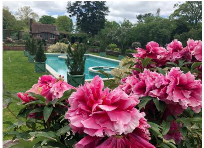
Peonies? at Planting Fields Arboretum