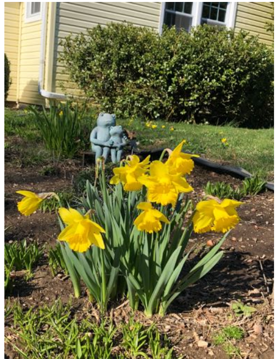
Frogs & Daffodils