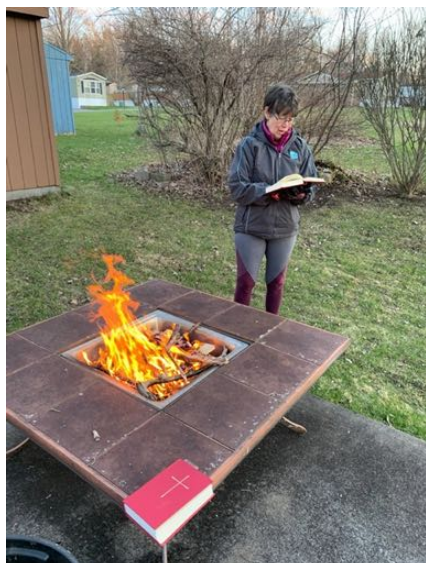
Easter Vigil service in the backyard!