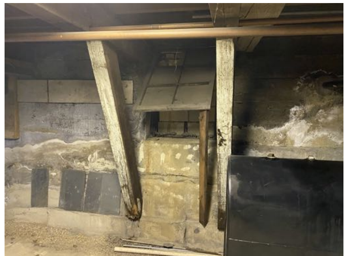
Support posts under the altar

March 1910 .... Just before Christmas we noticed that the altar was breaking away from the chancel wall. Investigations showed that the foundations under the chancel were weak. Early in January new props were put in with money furnished by St. Martha's Guild.